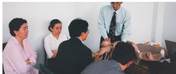
Figure 2. Top: Dr. Fernando Benavides teaching intrapartum fetal surveillance workshop. Center: Ecuadorian physician teaching malpresentation workshop. Bottom: Ecuadorian physician teaching malpresentation workshop.

aspiration demonstration supplies, and a pair of Tucker-McLane forceps to facilitate future courses.